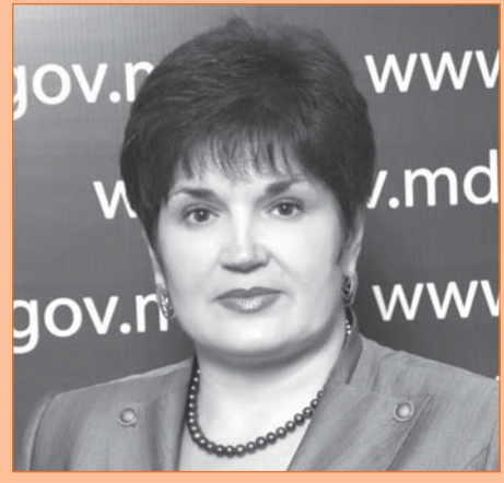
Valentina BULIGA, Minister of Labour, Social Protection and Family: