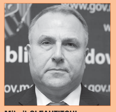
Mihail ŞLEAHTIŢCHI, Minister of Education